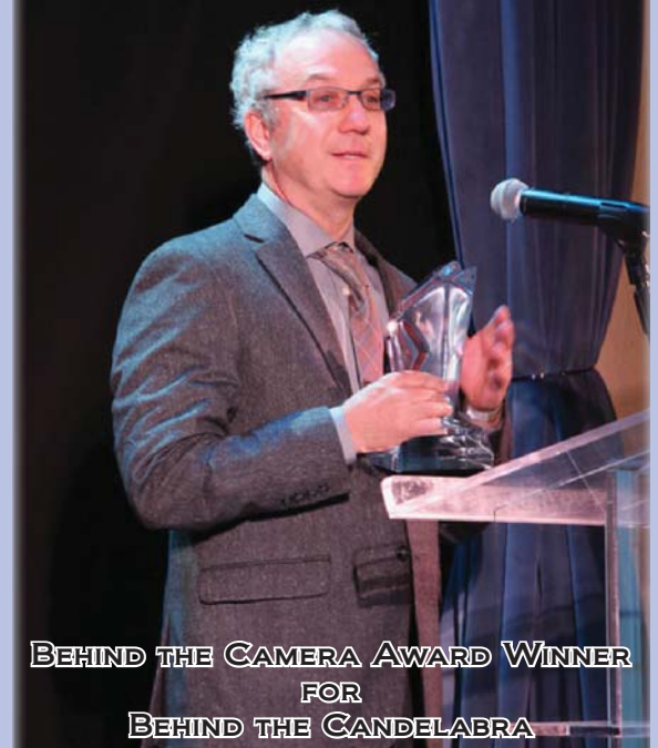
BEHIND THE CAMERA AWARD WINNER FOR BEHIND THE CANDELABRA