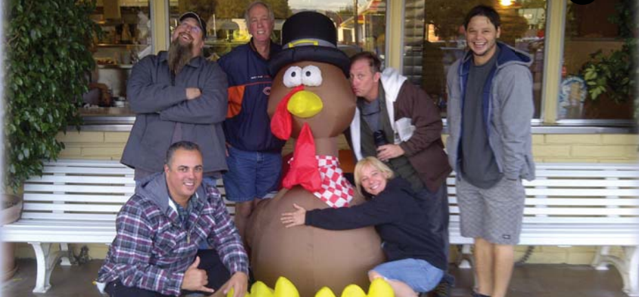
Super Fun Night Set Decorating Crew getting ready for turkey day.