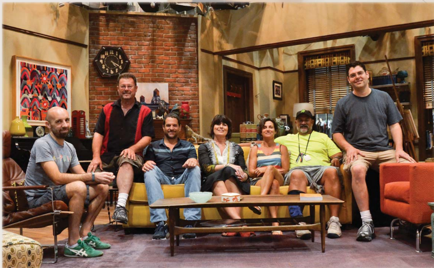
Set Decorating Left to right