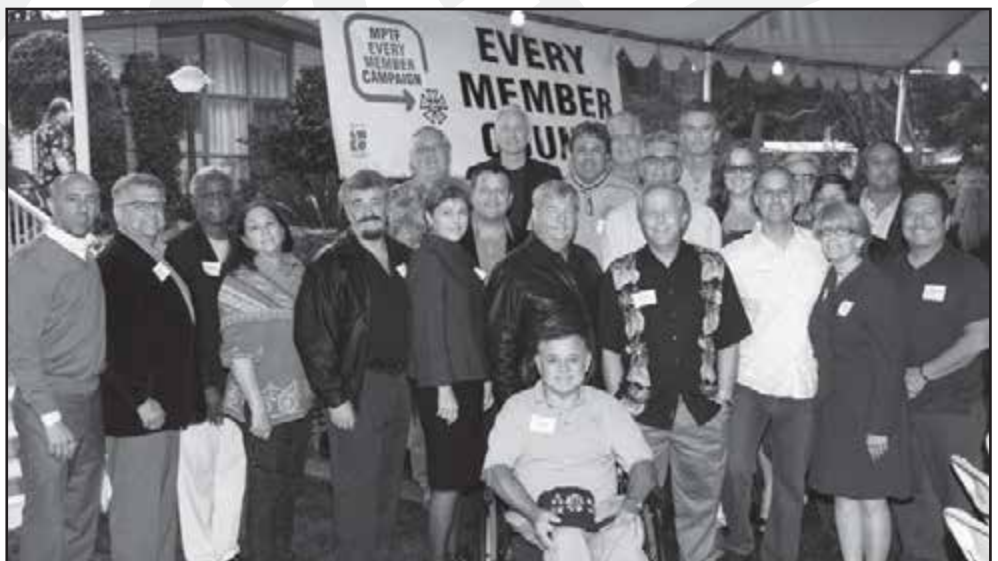
Local 44 Officers, Staff and Stewards attend the Every Member Campaign.